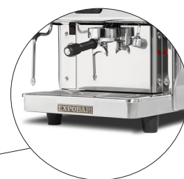
TA Option Available for all versions