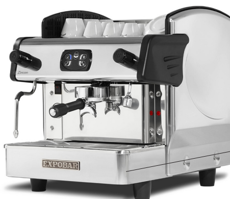
Zircon Mini 1GR