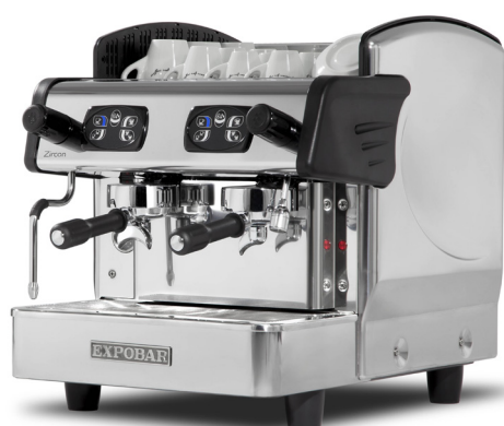
Zircon Mini 2GR